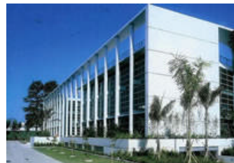
January 2009 we celebrated our first year in Brazil

would love to have all of our readers join with us to make these things happen. We have a couple of new projects we have started in the little town of Tabatinga in the Amazon region of Brazil. We have also started a new campaign that is a little of our beaten path. In Rio we are continuing our efforts with education, health issues, micro-finance and social programs.